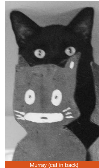
Murray (cat in back)